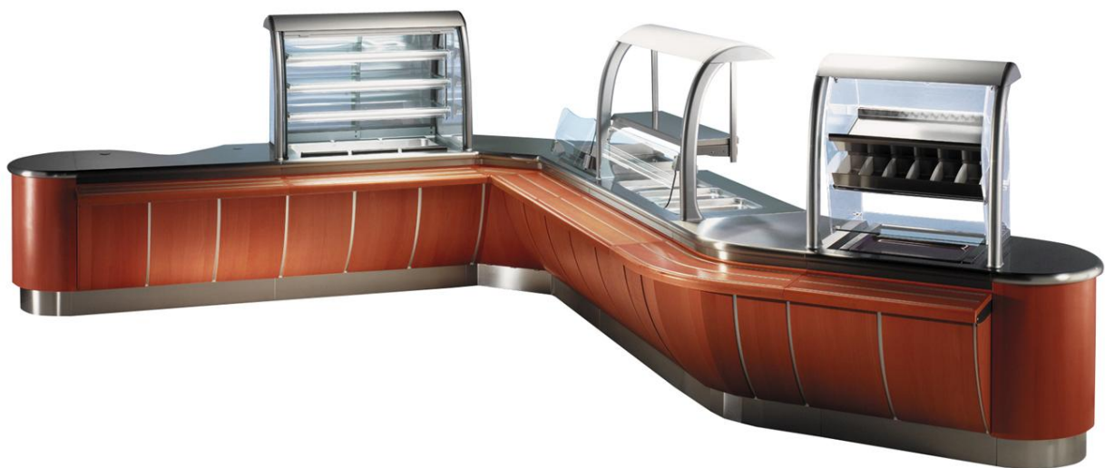
Complete line with curved frontal panels in cherry

The Electrolux Self Service has been developed from our extensive experience in designing commercial kitchens and self service solutions all over the world. It allows the professional caterer to create a self service area that offers the right functions and the required capacity, efficiently organising the flow of customers and service, while blending in with the rest of the furnishings. The Bain Marie units are designed to maintain, at the correct temperature, hot food in containers and to store crockery in the cupboard or space underneath. The dry heating Bain Marie range consists of models with 3, 4 or 6 GN container capacity .